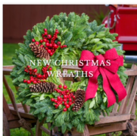
NEW CHRISTMAS WREATHS

**Please note that fundraiser pricing cannot be combined with other promo codes, discounts, or special including Color of the Month pricing A parent organized fundraiser